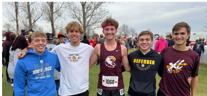
Former teammates and PC graduates surprised Pella Christian runners by showing up at the State Meet in Fort Dodge.

The very next day, I joined the boys and girls cross country teams at the State Meet in Fort Dodge. Previous PC teammates, who are now attending colleges in different locations, spent their Saturday traveling to Fort Dodge to cheer on our teams. They came to support former teammates and friends because of experiences and memories that were forged during long runs, bus rides and the thrill of competition.